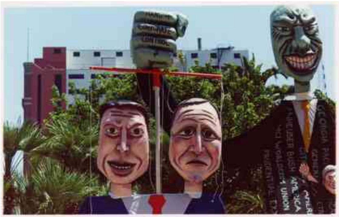
(Corporate Control Puppet, 2000 Democratic Primary, Los Angeles)

The most striking images though are often negative ones: the corporate control puppet at the 2000 democratic convention, operating both Bush and Gore like marionettes, a giant riot policeman who shoots out pepper spray, and endless effigies to be encompassed and ridiculed.