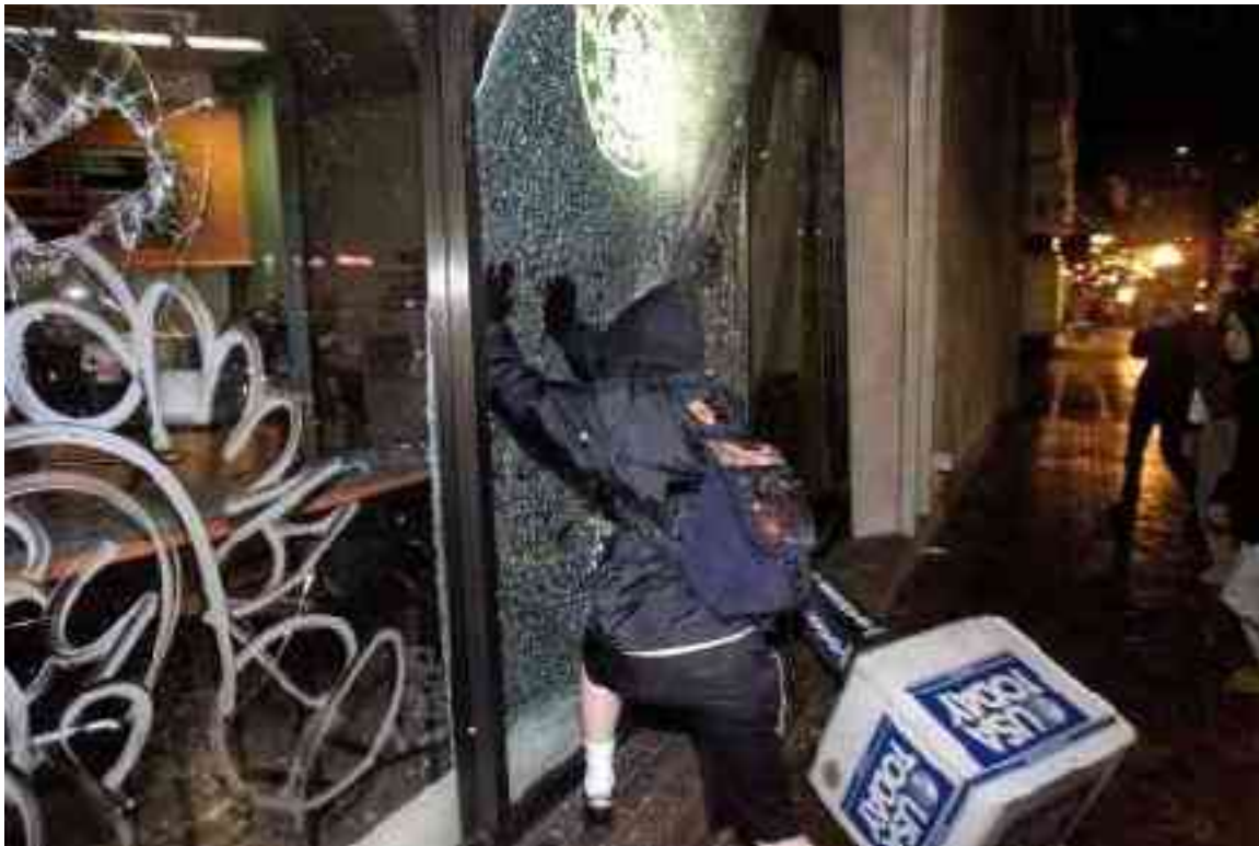
(the fall of one Starbucks in Seattle)

Property destruction is a matter of taking an urban landscape full of endless corporate facades and flashing imagery that seems immutable, permanent, monumental—and demonstrating just how fragile it really is. It is a literal shattering of illusions.