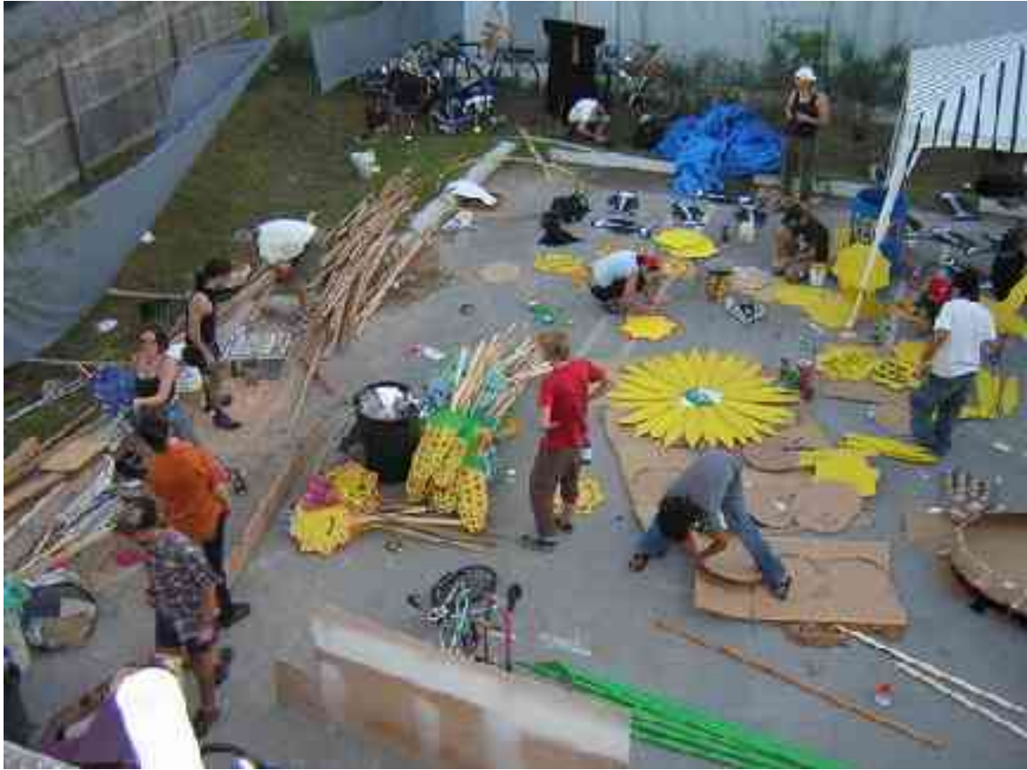
(a typical puppet workshop)

As for the images: these are clearly meant to encompass, and hence constitute, a kind of universe. Normally Puppetistas, as they sometimes call themselves, aim for a rough balance between positive and negative images. On the one hand, one might have the Giant Pig that represents the World Bank, on the other, a Giant Liberation Puppet whose arms can block an entire highway. Many of the most famous images identify marchers and the things they wear or carry: for instance, a giant bird puppet at A16 (the 2000 IMF/World Bank actions) was accompanied by hundreds of little birds on top of signs distributed to all and sundry. Similarly, Haymarket martyrs, Zapatistas, the Statue of Liberty, or a Liberation Monkeywrench might carry slogans identical to those carried on the signs, stickers, or T-shirts of those actually taking part in the action: