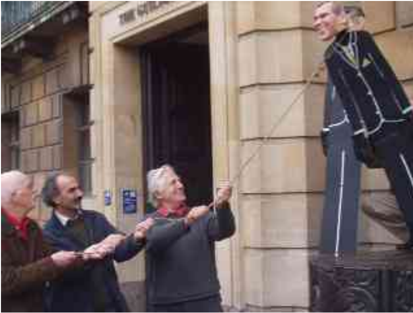
(Bush effigies pulled down in the UK)

The mocking and destruction of effigies is of course one of the oldest and most familiar gestures of political protest. Often such effigies are an explicit assault on monumentality. The fall of regimes are marked by the pulling down of statues; it was the (apparently staged) felling of the statue of Saddam Hussein in Baghdad that, in the minds of almost everyone, determined the moment of the actual end of his regime. Similarly, during George Bush's visit to England in 2004, protestors built innumerable mock statues of Bush, large and small, just in order to pull them down again.