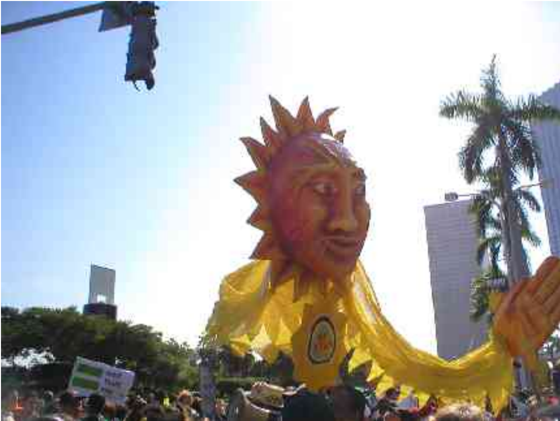
(Sun Puppet in Miami FTAA protests, 2003. All the Miami puppets were ultimately

Here too, puppets were singled out. In the months before the summit, the Miami city council actually attempted to pass a law making the display of puppets illegal, on the grounds that they could be used to conceal bombs or other weapons. 19 It failed, since it was patently unconstitutional, but the message got out. As a result, the Black Bloc in Miami actually ended up spending most of their time and energy on protecting the puppets. Miami also provides a vivid example of the peculiar personal animus many police seem to have against large figures made of papier-mâché. According to one eyewitness report, after police routed protestors from Seaside Plaza, forcing them to abandon their puppets, officers spent the next half hour or so systematically attacking and destroying them: shooting, kicking, and ripping the remains; one even putting a giant puppet in his squad car with the head sticking out and driving so as to smash it against every sign and street post available.