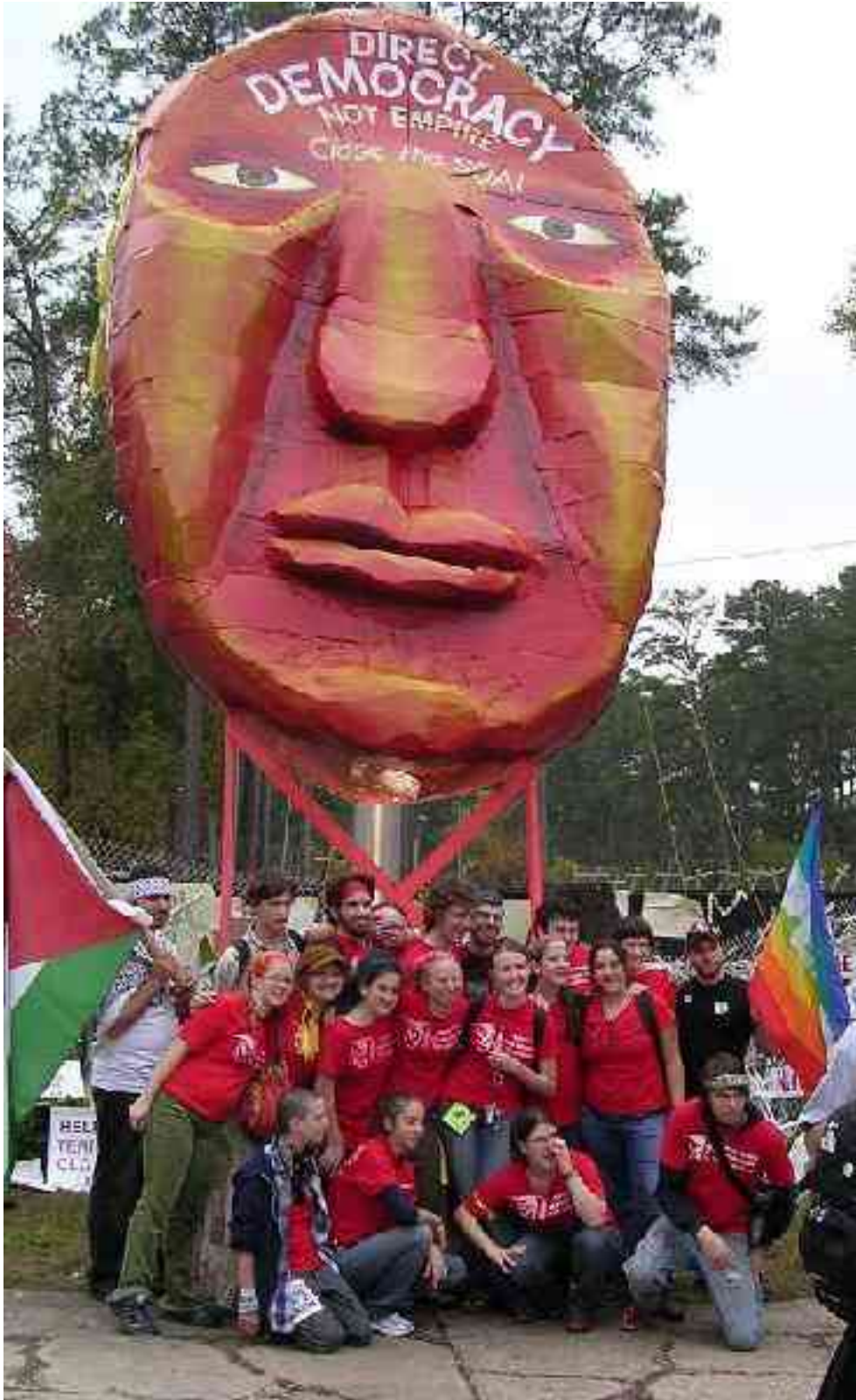
(Direct Democracy Puppet, School of Americans Protest)