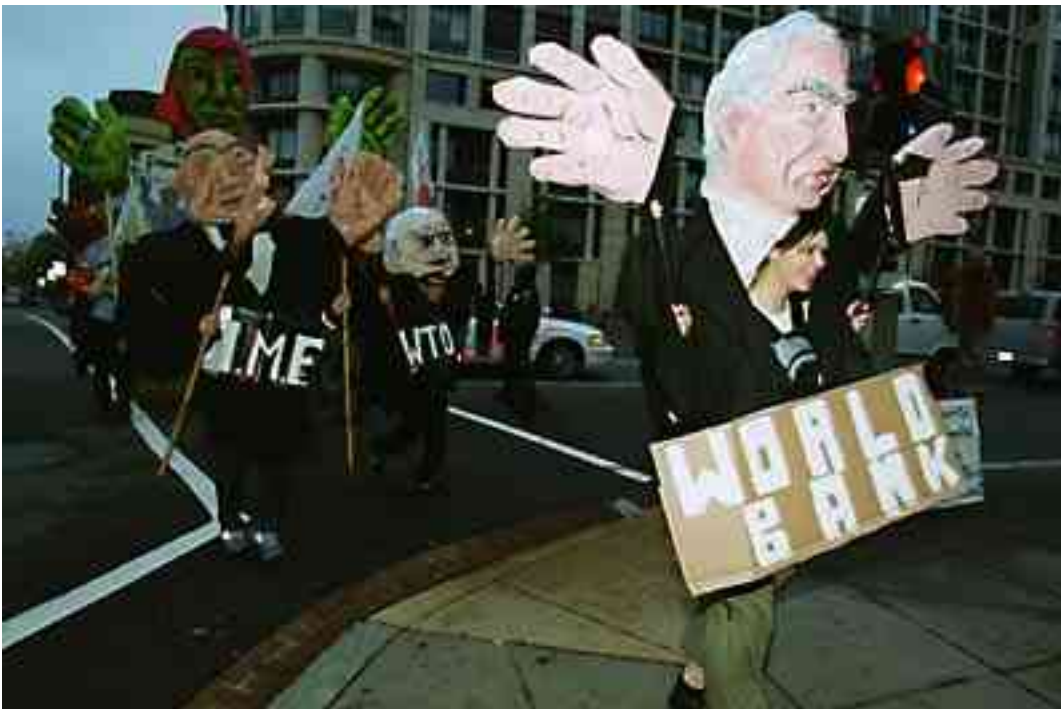
(World Bank, IMF, WTO Puppets, A16)