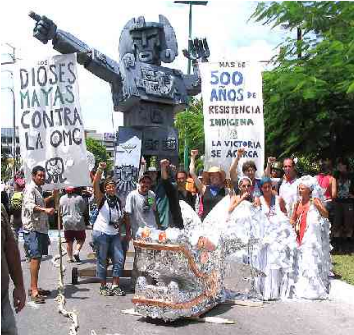
(Maya God puppet, 2003, WTO Meetings in Cancun)

Still, if giant puppets, generically, are gods, most are obviously, foolish, silly, ridiculous gods. It as if the process of producing and displaying puppets becomes a way to both seize the power to make gods, and to make fun of it at the same time. Here one seems to be striking against a profoundly anarchist sensibility. Within anarchism, one encounters a similar impulse at every point where one approaches the mythic or deeply meaningful. It appears to be operative in the doctrines of Zerzanites and similar Primitivists, who go about self-consciously creating myths (their own version of the Garden of Eden, the Fall, the coming Apocalypse), that seem to imply they want to see millions perish in a worldwide industrial collapse, or that they seek to abolish agriculture or even language—then bridle at the suggestion that they really do. It's clearly present in the writings of theorists like Peter Lamborn Wilson, whose meditations on the role of the sacred in revolutionary action are written under the persona of an insane Ismaili pederastic poet named Hakim Bey. It's even more clearly present among Pagan anarchist groups like Reclaiming, who since the anti-nuclear movement of the '80s, 10 have specialized in conducting