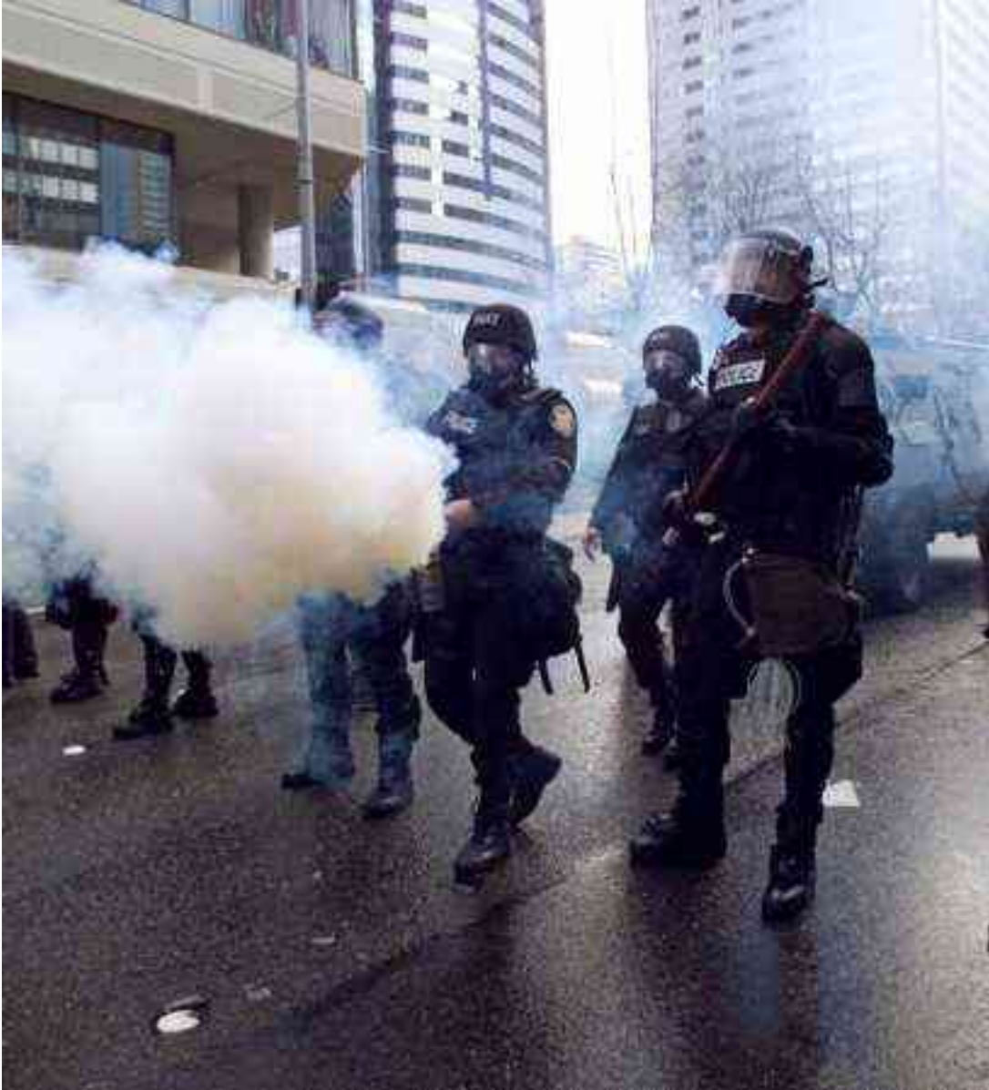
(typical police images from Seattle, WTO actions, November 1999)

From the point of view of security officials during this period, rallying the troops was presumably the easy part. The stickier problem was what to do with the fact that the bulk of the American public refused to see the global justice movement as a threat. The only survey I am aware of taken at the time that addressed the question—a Zogby America poll taken of TV viewers during the Republican convention in 2000—found that about a third claimed to feel “pride” when they saw images of protestors on TV, and less than 16% percent had an unqualified negative reaction. 24 This was especially striking in a poll of television viewers, since TV coverage